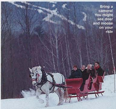
Bring a camera! You might see deer and moose on your ride

TALK ABOUT A WINTER WONDERLAND: An average of 333 inches of snow blankets Stowe each year, providing a powdery playground for every level of adventurer. On weekends, residents of Boston and New York City flock to this northern Vermont town to hit the slopes, but there's plenty to do off the mountains too. (Sleigh riding, anyone?) Pack some warm clothes and this weekend guide—and get ready for three action-packed days that will make you wish winter lasted all year long.