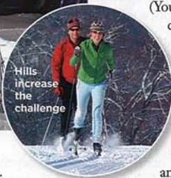
Hills increase the challenge

a café (open from 10 a.m. to 3:30 p.m. daily) where you can refuel with snacks, soups, and sandwiches. Make your way back to the Nordic Center and hit the road for your next adventure.