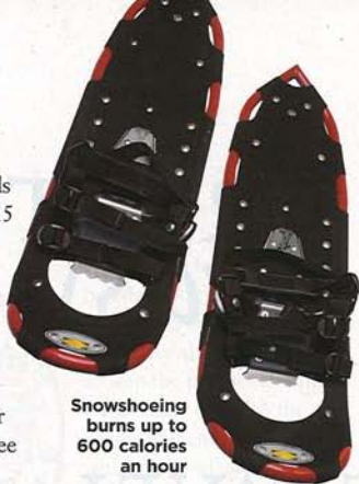
Snowshoeing burns up to 600 calories an hour

through the woodlands around the factory ($15 including snowshoes; tours depart every hour on the hour from 11 a.m. to 4 p.m.; umiak.com ). After working up a sweat, you'll get a tour of the factory and a free ice cream sample. Go ahead and treat yourself to a double scoop of your favorite flavor—you burned some serious calories this weekend!