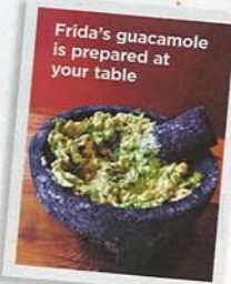
Frida's guacamole is prepared at your table

✓ WHERE TO EAT In addition to the usual Mexican fare, Frida's Taqueria and Grill (128 Main Street, Stowe; fridastaueria.com ) serves up healthy options like the chinampas taco, which is filled with yams, squash, and grilled cactus paddle (it tastes like asparagus). For an unforgettable New American meal—paired with a glass of vino from an award-winning wine list—try the Blue Moon Café (35 School Street; bluemoonstowe.com ). Menus change monthly, depending on the available local ingredients.