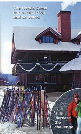
The Nordic Center has a rental shop and ski school